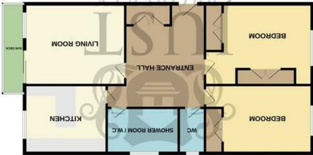
SECOND FLOOR FLAT 1147 sq.ft. (106.6 sq.m.) approx.